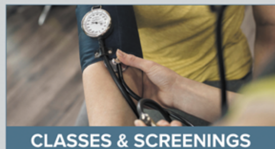
CLASSES & SCREENINGS

NURTURE - SELF-CARE PROGRAM: This program is designed to nurture your mind, body and spirit. Our relaxing atmosphere will allow you to focus on your breathing, learn more about Comfort Touch, experience the benefits of gentle exercise, learn tips to fuel your body, and be taken on a journey through guided imagery. RSVP is required by calling 812.933.3741.