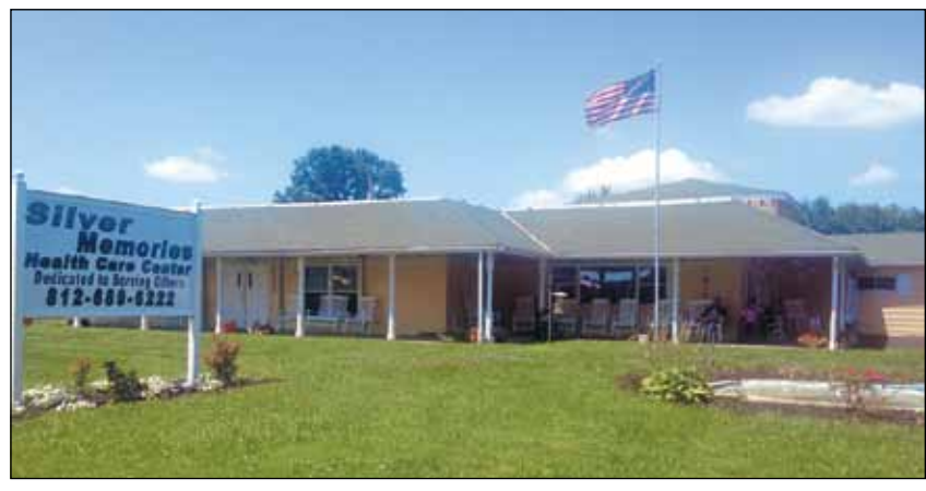
Silver Memories Health Care