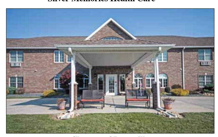
Chateau of Batesville