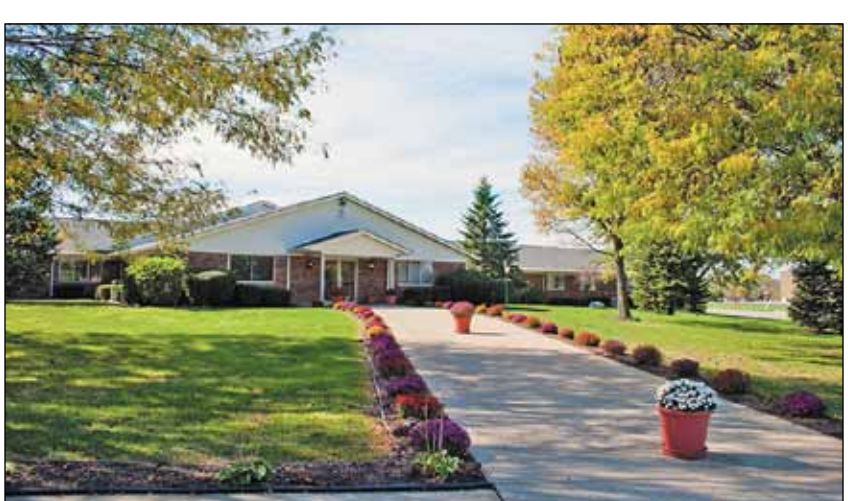
Arbor Grove Village