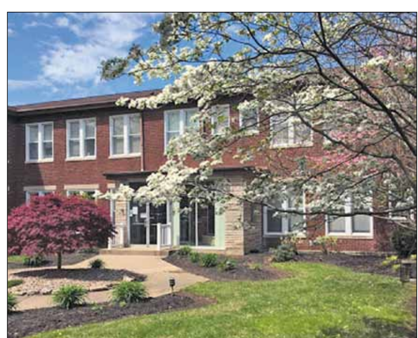
The Waters of Dillsboro-Ross Manor