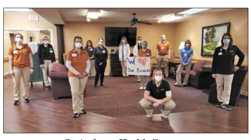
St. Andrews Health Campus