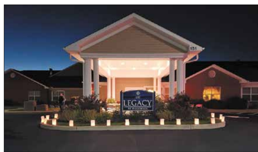
Ridgewood Health Campus