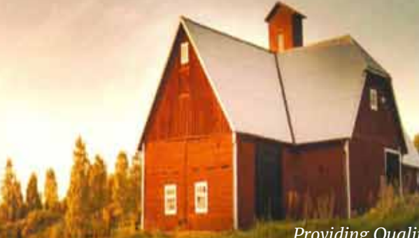
Providing Quality Insurance since 1900

Franklin County Farmers Mutual Insurance Home, Auto, Farm, Commercial and Small business Insurance