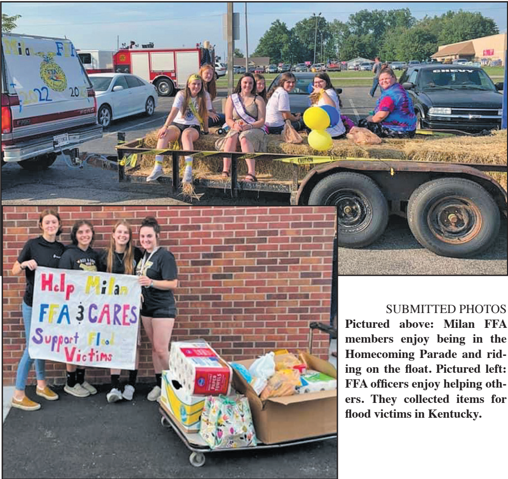
Pictured above: Milan FFA members enjoy being in the Homecoming Parade and riding on the float. Pictured left: FFA officers enjoy helping others. They collected items for flood victims in Kentucky.