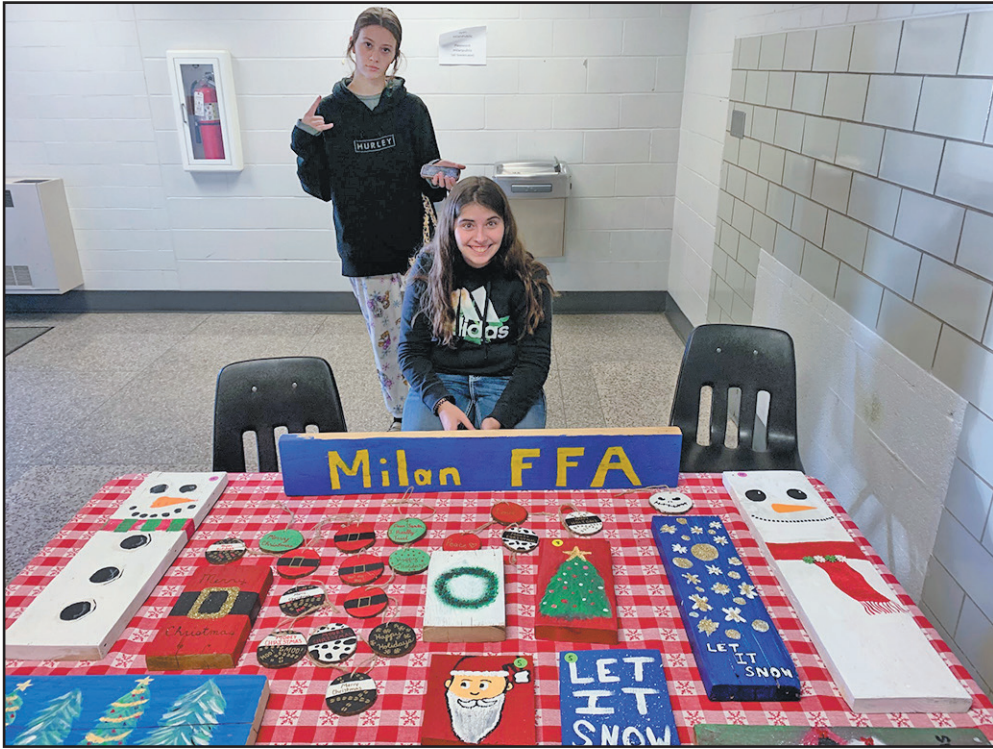
Ag students are all set up and ready to make some money on these craft projects.