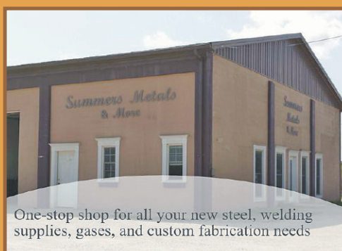
One-stop shop for all your new steel, welding supplies, gases, and custom fabrication needs