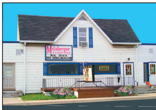
Locally owned since 1976.

Enter to win $200 on our Facebook business page by commenting your best guess of the weight of the winning pumpkin on Saturday, September 28 after the parade!