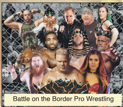
Battle on the Border Pro Wrestling