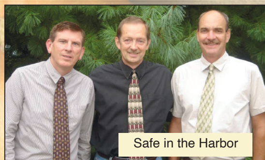
Safe in the Harbor

Supplement to The Versailles Republican Thursday, September 19, 2024 Sponsored by the Versailles Lions Club