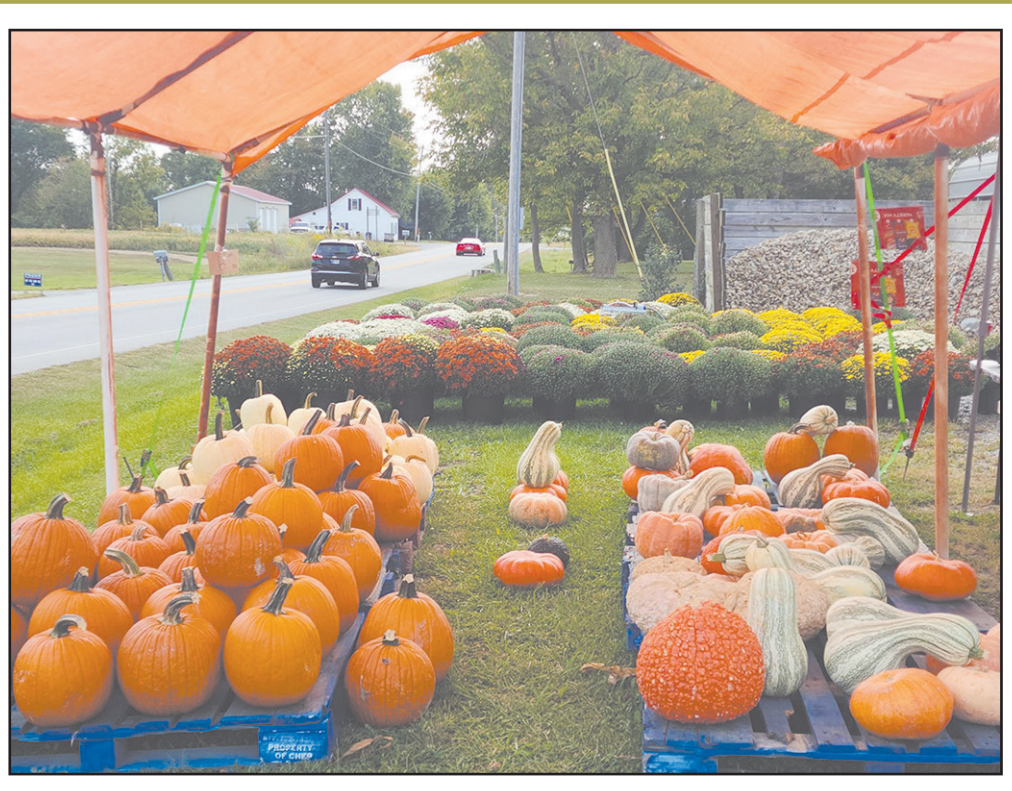
Grandpa's Live Bait has all of your fall decor from pumpkins, gourds, melons, straw bales and beautiful, colorful mums.