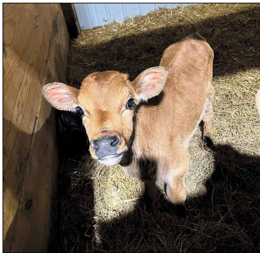
SUBMITTED BY JESSICA MOBLEY

A flock of chickens at Triple Cross Ranch keep many eggs coming to the community.