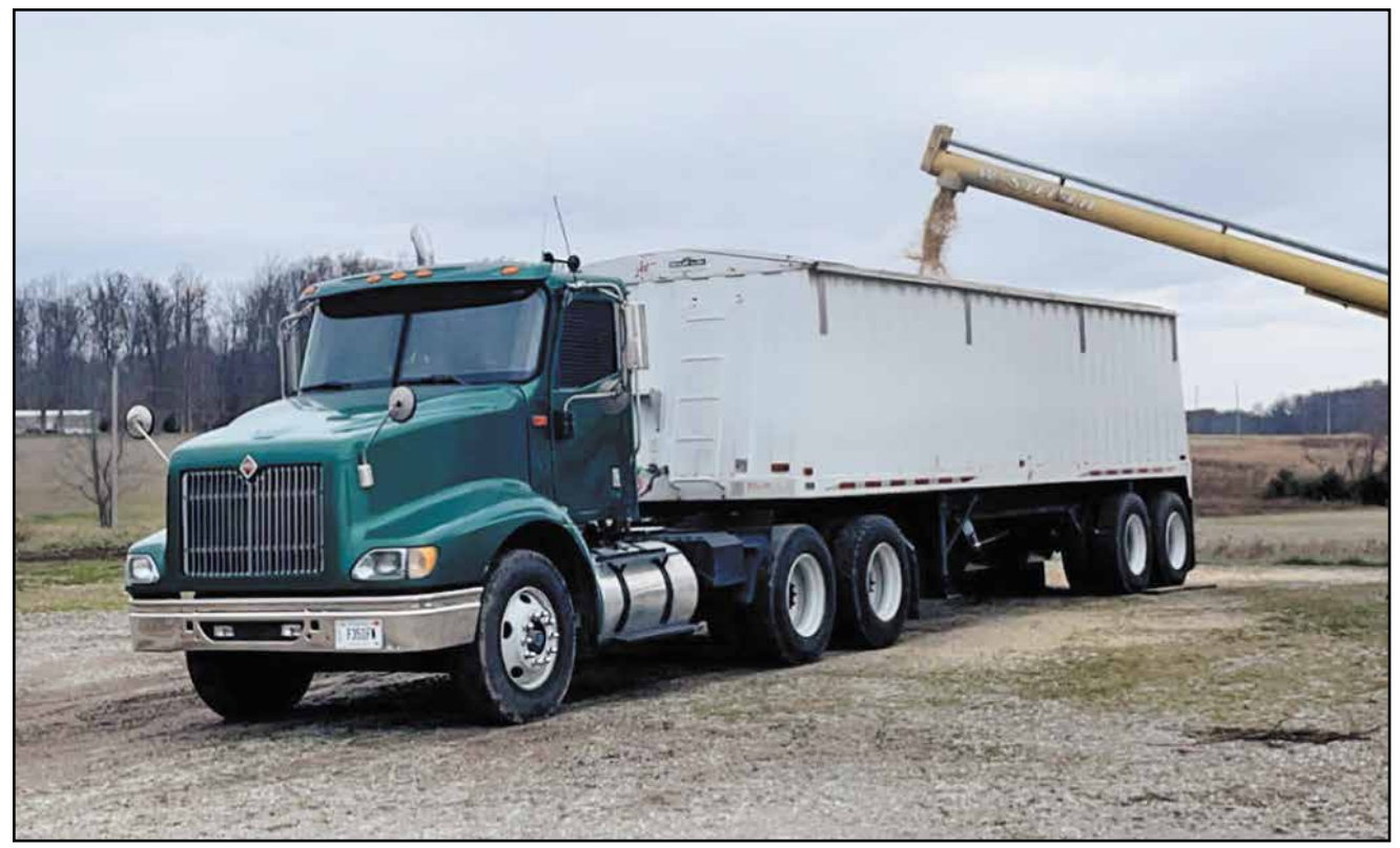
SUBMITTED BY STRATTON FARMS

You might see Stratton Farms in the fields loading down the semis getting ready to take grain to Aurora.