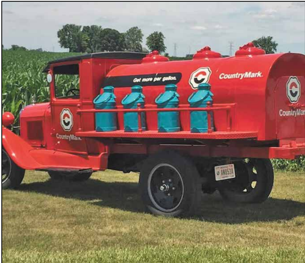
SUBMITTED BY LAUGHERY VALLEY AG

Pictured is an older model CountryMark farm truck used by Laughery Valley Ag Co-op.