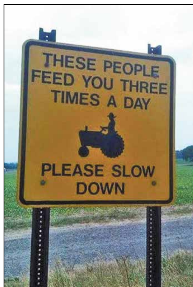
SUBMITTED BY LAUGHERY VALLEY AG Beware and be cautious of your farmers. Slow down!

There's no shortage of reasons to support a thriving agricultural sector. Indeed, consumers from all walks of life benefit in myriad ways when the success of the agricultural sector is prioritized. TF253872