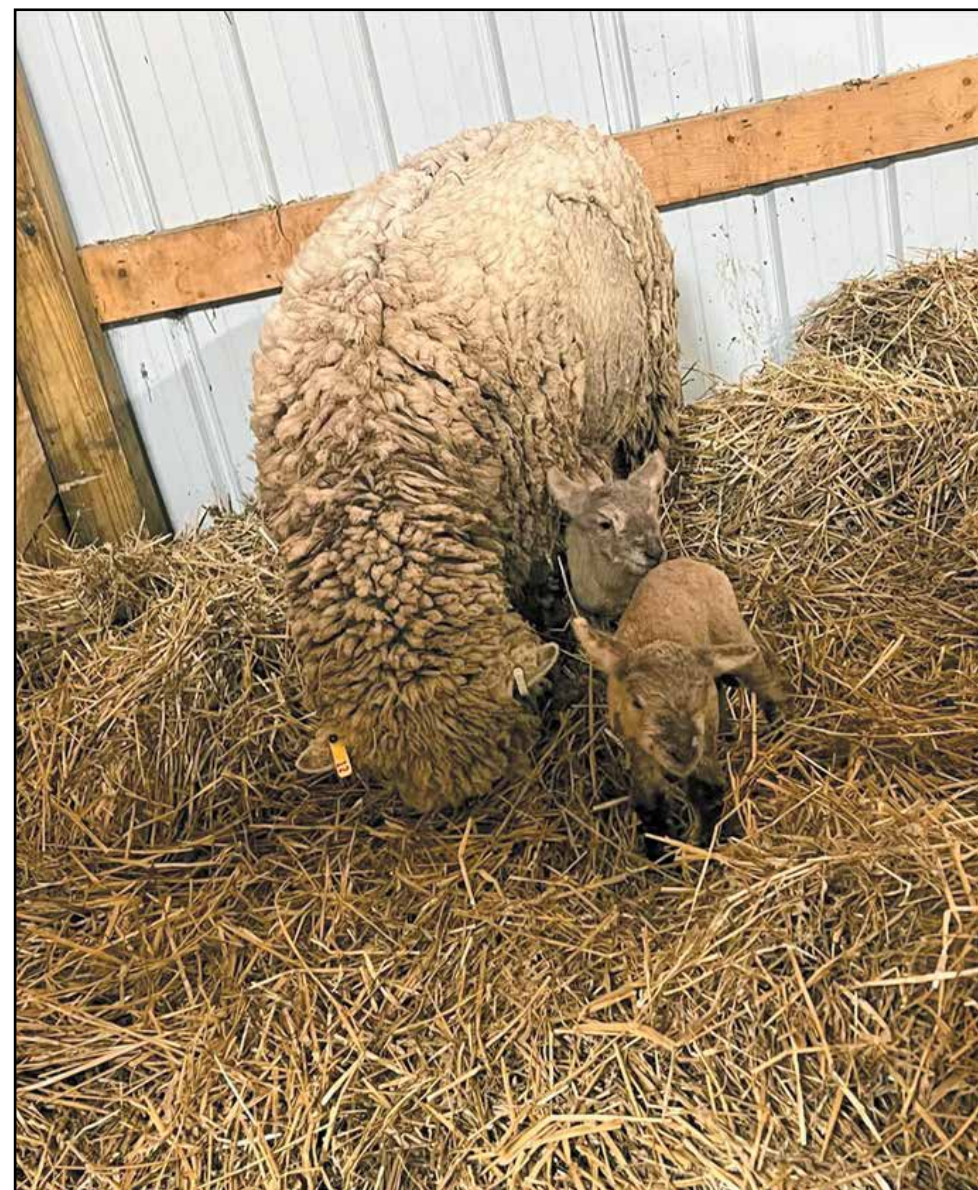
SUBMITTED BY JESSICA MOBLEY

Bonnie, a sheep at Triple Cross Ranch, is shown with two of her lambs in the stable.