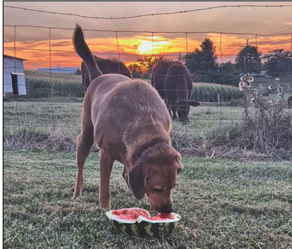
SUBMITTED BY STRATTON FARMS

Pictured is an older model CountryMark farm truck used by Laughery Valley Ag Co-op.